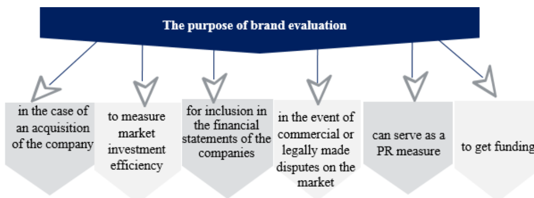
Figure 3- The utility of brand assessment by entities