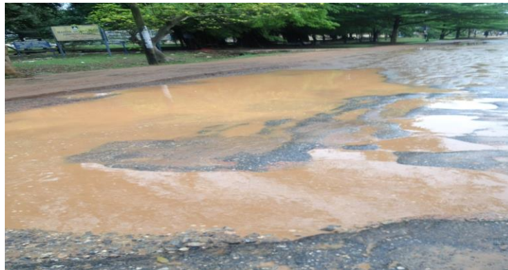
Figure 2- Picture of LASU Dilapidated Road Network as at 05/03/2016