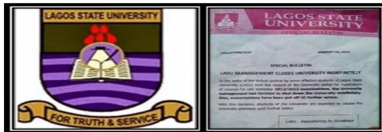
Figure 1 - Picture of LASU Bulletin (online) indicating University's closure

Although the University has a philosophy of utilizing all available resources to provide every deserving candidate the opportunity to further higher education and be a seat of learning, (in) pursuit of truth and character as well as (achieving) excellence in teaching, research and community service (LASU, 2017); the institution had been bedeviled with a mirage of crisis that have over the years stained her brand image in the minds of stakeholders. For example, newspaper reports by Olugbamila and Clement (2014) and Asomba (2015) expressed the unending restiveness and turmoil that has occurred in the 33 years old University. The writers observed that despite promulgation of policies by both the University Management and the Lagos State Government to abate the internal wrangling; students' riots, unions strike, lockout, picketing and closures held sway and paralyzing academic activities during the 2011/ 2012, 2012/ 2013, 2013/ 2014, 2014/ 2015, academic sessions.