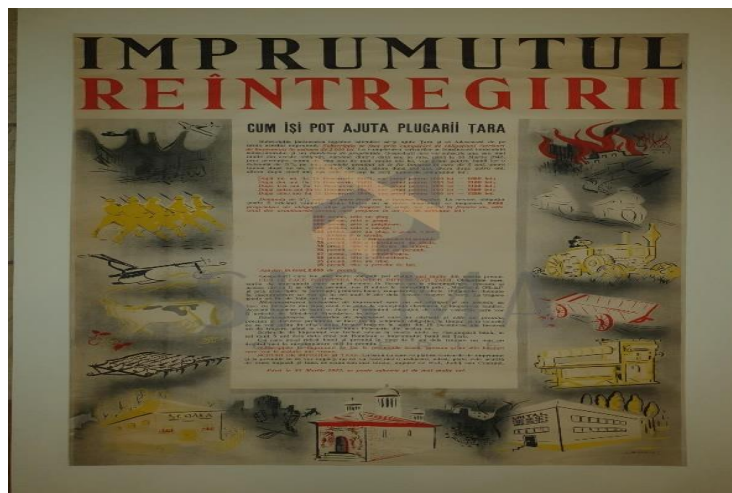
Figure A2 – The Loan of Reunion